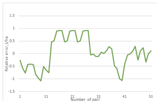
Figure 2. Relative errors of the model for stevia fresh biomass yield depending on plant density (artificial neural network computation).