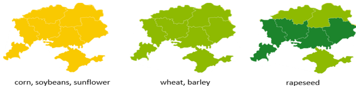
Figure 2. Mapping of the suitability of the non-irrigated agricultural lands in the Steppe zone of Ukraine for the cultivation of major crops (color scheme: yellow – unfavourable; light green – conditionally suitable; green – suitable)

To facilitate the comprehension of the results, agroecological crop mapping was performed and is presented in (Fig. 2). The coastal areas of the steppe zone are the best districts for rainfed rapeseed cultivation.