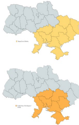
Figure 1. Steppe zone of Ukraine: the total area and the studied area

The agroecological zoning of the steppe zone of Ukraine (partially, as Kharkiv, Donetsk and Luhansk regions were not encountered in the study, as presented in Fig. 1) was carried out based on the proposed methodology of the AEZI calculations with further gradation and mapping of the areas (Lykhovyd, 2024).