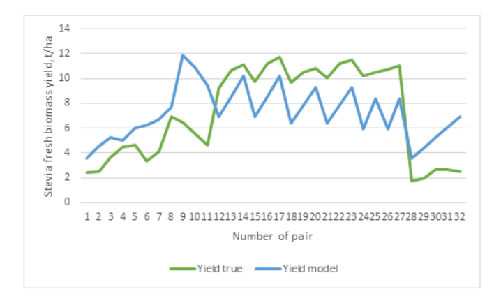
Figure 3. Approximation of the model of stevia fresh biomass yield depending on NPK fertilizers rates.

We are the first to develop and offer mathematical models of stevia productivity formation. Further studies will be targeted on the determination of the best options of sowing dates for the crop.