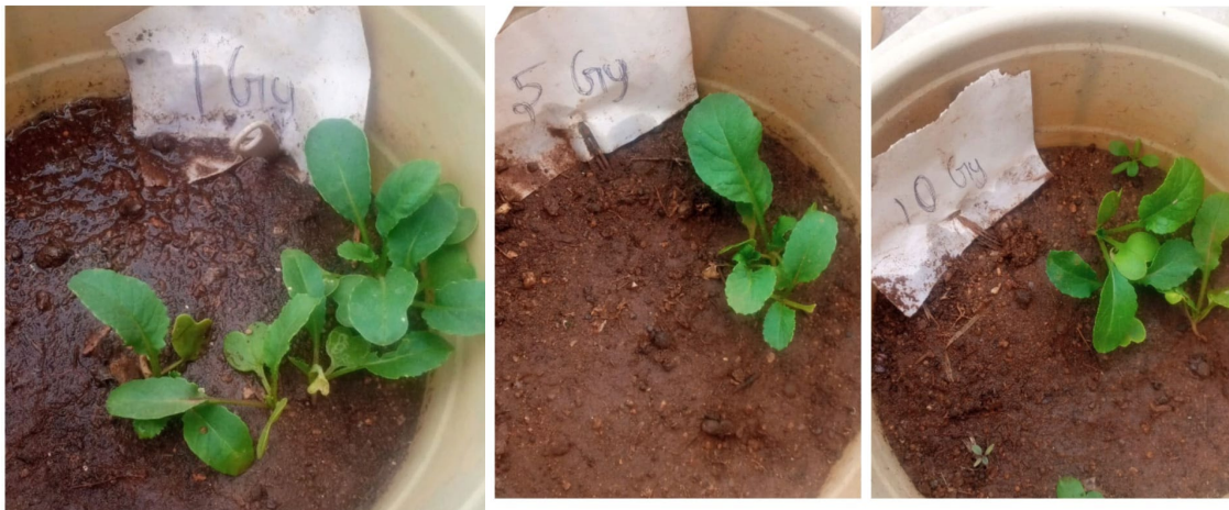
Figure 3. The seed propagation and seedling growth of radish at 40 th day

Our study corroborated the previously reported stimulatory effects of low doses of photon radiation, particularly evident at the 10 Gy photon irradiation level. At this dosage, optimal outcomes were observed for seed propagation percentage on the 20 th day, as well as shoot growth initiation percentage, shoot, and leaf lengths on the 40 th day. This is consistent with findings from previous studies (Charbaji and Nabulsi, 1999; Kim et al., 2000, 2005; Chakravarty and Sen, 2001; Baek et al., 2005). However, doses exceeding 10 Gy demonstrated inhibitory effects on seed propagation percentage, consistent with prior research (Abdel et al., 1999). Seed propagation percentage steadily increased up to 10 Gy by the end of the 20 th day, with the highest recorded percentage (65.6%) observed at this dose. The stimulatory effect of low-dose photon irradiation on seed propagation may be attributed to the activation of RNA or protein synthesis (Fig. 3) (Chaomei et al., 1993).