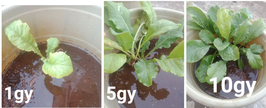
Figure 4. The seed propagation and seedling growth of Radish at 60 th day

By the 60 th day of the study, the most favourable outcomes were observed from the 5 Gy treatment across parameters such as seedling and leaf lengths, seedling fresh weight, seedling dry matter content, and total chlorophyll content, as illustrated in Figure 4. Results from the control and doses exceeding 5 Gy were inferior to those at 5 Gy. Seedlings irradiated with 5 Gy exhibited accelerated growth compared to other doses. The highest recorded seedling and leaf lengths were 9.6 cm and 6.8 cm, respectively. Conversely, consistently lower results were observed with 01 Gy photon radiation, indicative of its inhibitory effects. These findings align with previous studies indicating that high doses of photon rays disrupt protein synthesis, water exchange, enzyme activity, production of growth hormones and Indole Acetic Acid (IAA), leaf gas exchange, and overall plant physiology (Rabie et al., 1996; Chandorkar et al., 1986; Stoeva et al., 2001; Kovacs et al., 2002).