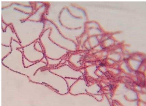
Figure 1. Sudan black staining showing B. megaterium cells (pink) with PHB granules (bluish black).

The Aloe Vera plant is thought to have pharmacological effects that include anti-inflammatory, anti-arthritis, antimicrobial, and hypoglycemic properties. Aloe Vera 's antibacterial and antifungal capabilities shield the scalp against the development of dandruff. The Aloe Vera plant is beneficial for preventing fungal diseases like alopecia. One might assume that Aloe Vera fresh gel's healing properties in wounds and superficial skin injuries are among its other benefits. Similar to this, taking this medicine causes less pain at the site of the trauma. The Sudan black staining in fig. 1 reveals B. megaterium cells (pink) containing PHB granules (bluish black).